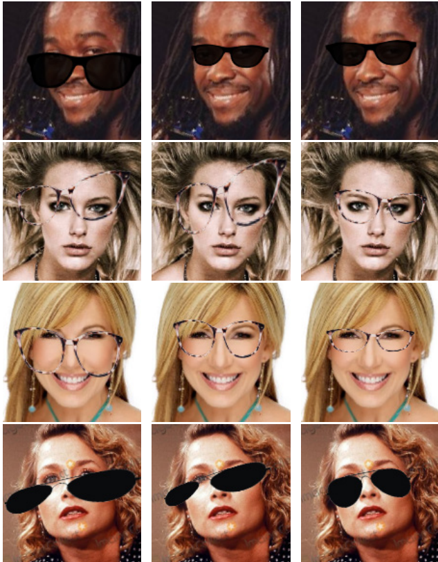
Initial composite 5 th update (b) Ours (a) ST-GAN