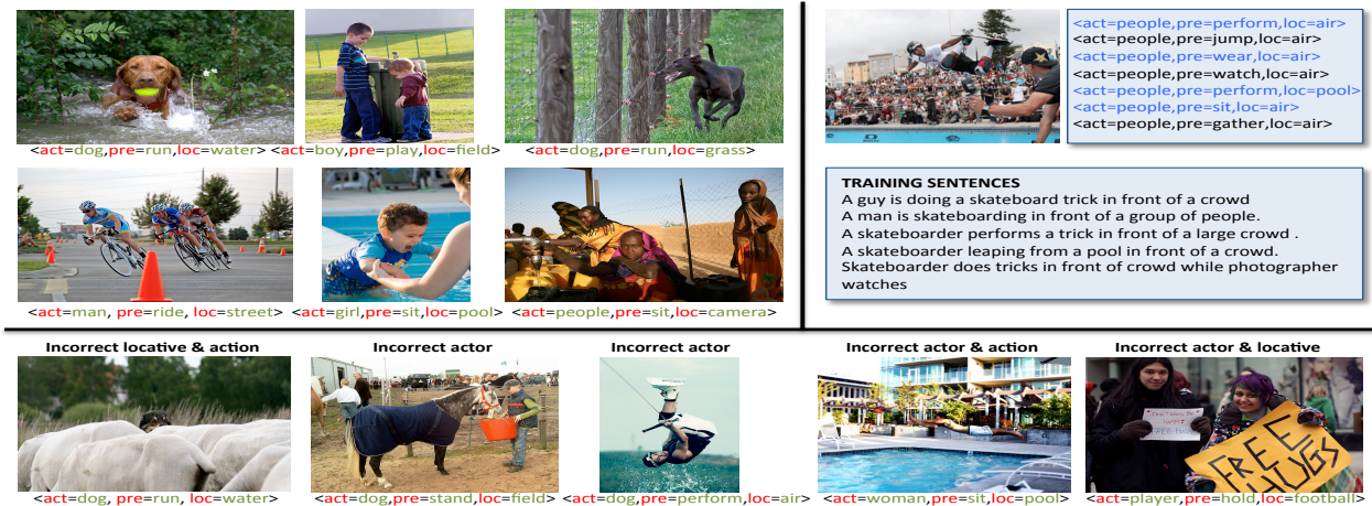
Figure 2: Samples of predicted tuples. Top-left: Examples of visually correct predictions. Bottom: Typical errors on one or several arguments. Top-right: Sample image and its top predicted tuples. The tuples in blue were not observed neither in the SP-Dataset nor in the automatically enlarged dataset. Note that all of them are descriptive of what is occurring in the scene.

ysis approach of Hodosh et al. (2013). We first note that this approach is able to rank a list of candidate captions but cannot directly generate tuples. To generate tuples for test images, we first find the caption in the training set that has the highest ranking score for that image and then extract the corresponding semantic tuples from that caption; 3) Indicator Features (IND), this is a standard factorized log-linear model that does not use any feature representation for the outputs; 4) A model that uses the skip-gram continuous word representation of outputs (SCWR); 5) A model that uses that semantic equivalence representation of outputs (SER); 6) A combined model that makes predictions using the best feature representation for each argument type (COMBO).