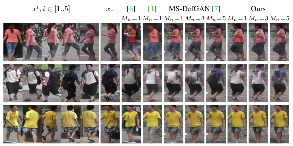
Figure 3. A qualitative comparison on the Market-1501 dataset. The first column shows the source images. [6] and [1] use only the first source image. The target poses are given by the ground truth images in column 2. In column 4, we show the results obtained by our model from increasing numbers (M_n) of source images. The source from the first column are added while increasing M_n from left to right. We can see that the overall shapes of the persons look better in our results, such as the pants.

we train the models from the beginning to the end with a fixed number of inputs and evaluate using the same model without re-training. The Market-1501 dataset model is trained with 12 input images, and the DeepFashion dataset model is trained with 3 inputs.