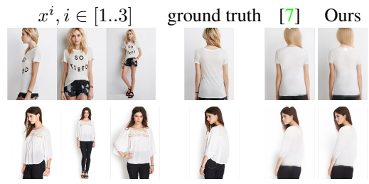
Figure 4. Qualitative results on DeepFashion Dataset.

We have presented an approach for pose-conditioned human image generation based on using a differentiable ren-