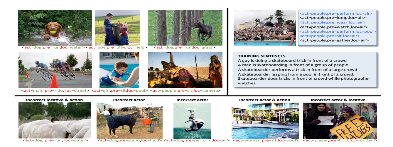
Figure 2: Samples of predicted tuples. Top-left: Examples of visually correct predictions. Bottom: Typical errors on one or several arguments. Top-right: Sample image and its top predicted tuples. The tuples in blue were not observed neither in the SP-Dataset nor in the automatically enlarged dataset. Note that all of them are descriptive of what is occurring in the scene.

ysis approach of Hodosh et al. (2013). We first note that this approach is able to rank a list of candidate captions but cannot directly generate tuples. To generate tuples for test images, we first find the caption in the training set that has the highest ranking score for that image and then extract the corresponding semantic tuples from that caption; 3) Indicator Features (IND), this is a standard factorized log-linear model that does not use any feature representation for the outputs; 4) A model that uses the skip-gram continuous word representation of outputs (SCWR); 5) A model that uses that semantic equivalence representation of outputs (SER); 6) A combined model that makes predictions using the best feature representation for each argument type (COMBO).