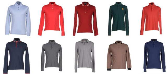
Fig. 1. Example of a text and nearest images from the test set. Our embedding produces low distances between texts and images referring to similar objects.

colors, sizes, etc. Existing approaches for retrieval focus image-only and require hard to obtain datasets for training [2]. Instead, we opt to leverage easily obtained metadata for training our model, and learning a mapping from text and images to a common latent space, in which distances correspond to similarity.